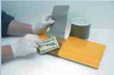
Apply the EASYPLOT® masking film with the help of the ORACOVER® felt blade (ref. no. 0915), avoid bubbles.