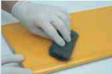
ORACOVER® can be buffed with 000 grade steel wool.