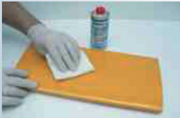
Before painting/spraying clean with ORACOLOR® thinner.