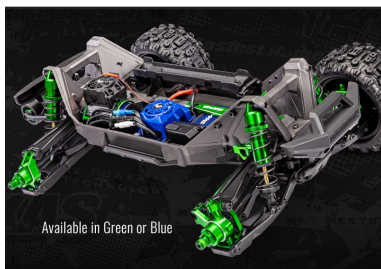
Available in Green or Blue